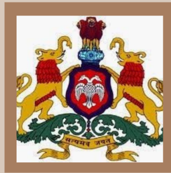
Govt Of Karnataka