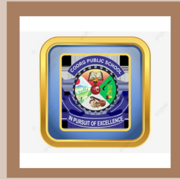
Coorg Public School and PU College